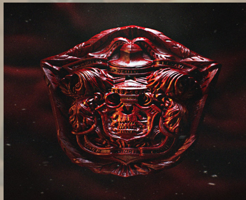
Crimson Peak Family Crest Designed for the American Gothic Romance film directed, co-produced and co-written by Guillermo del Toro

Learning that there was a family crest ring involved, I decided to do a little digging on my own. The name Crimson is quite curious indeed. I found a Crimson Peak family crest that initially provoked excitement, but also a rather instant chill at the prospect of what I had uncovered.