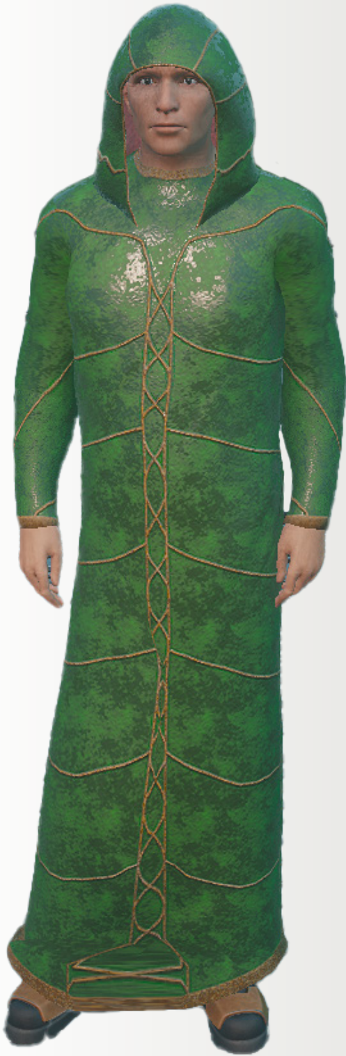
Elder God Lector Robe

The Church of the Elder Gods (DSEC9/Mountain of Madness) and Church of the Elder Gods (Planet Toulan) mission chain was introduced in our Nov 28, 2023 Planet Partner VU.