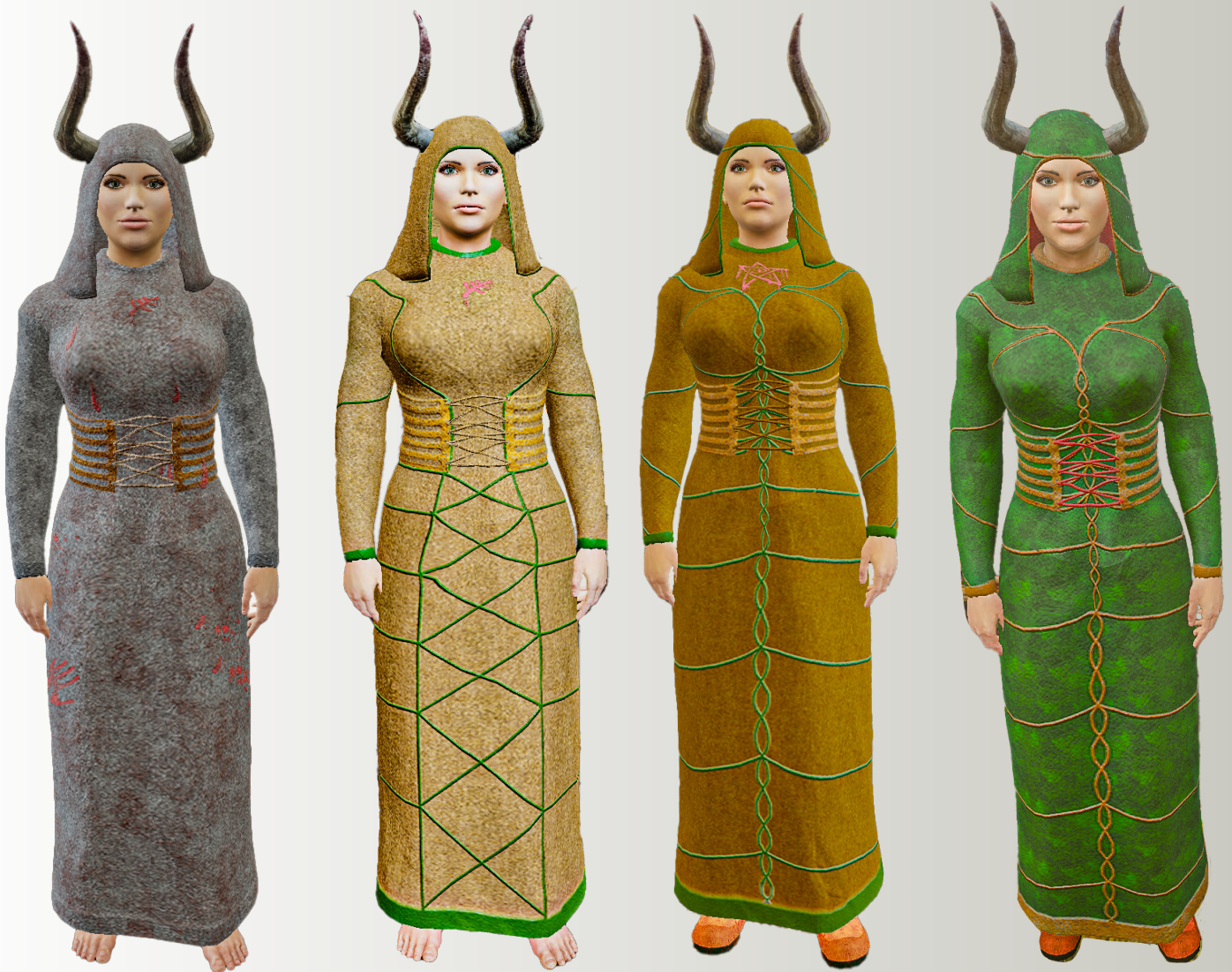
Initiate Elder Robe

Following are photos of the first 4 Elder God Robes you work toward but do not get to keep because you turn each one in when you advance to the next level. They are also not tradable. Only the final Elder God Robe (High Priestess/High Priest) are you able to keep and is tradable.