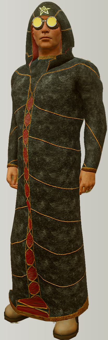
High Priest Elder Robe

A: I would like to be able to accept all available missions with one single click, instead of having to click every individual mission, one by one. Just like you are already able to click the pedestal called Elder Shrine inside the Elder Church on DSEC9, and by doing so you automatically activate 4 hunting missions.