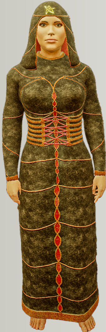
High Priestess Elder Robe

... First to Discover all 5 (F) Elder God Robes